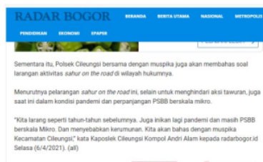
Figure 4.4 Habib Rizieq Says Bima Arya's Shouting Triggers Unrest

News written by Radar Bogor has titles and news content that are relevant to the news material. For example, the news above with the headline " Habib Rizieq Says Bima Arya's Shouting Triggers Unrest"