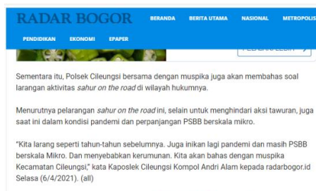
Figure 4.4 Habib Rizieq Says Bima Arya's Shouting Triggers Unrest

News written by Radar Bogor has titles and news content that are relevant to the news material. For example, the news above with the headline " Habib Rizieq Says Bima Arya's Shouting Triggers Unrest"