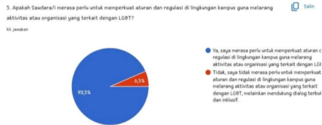
Picture. 4 Students' assessments and opinions regarding strengthening campus rules and regulations to prohibit LGBT-related activities

carried out by the Prophet Lut and the creation of humans created by Allah. mate with each other (husband and wife) and reproduce for future survival.