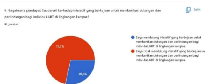
Figure 3. Student assessments and opinions regarding initiatives aimed at providing support and protection for LGBT individuals

Regarding the question regarding the importance of special treatment from an Islamic religious perspective regarding the LGBT phenomenon, data obtained that 89.1% of respondents chose YES and 10.9% of respondents chose NO. Students are of the opinion that the LGBT phenomenon requires special handling from an Islamic religious perspective to ensure a sensitive approach and in accordance with religious values so that students better understand and understand the religion that LGBT is a very deviant and haram issue in the Islamic religion. The second result obtained was that 10.9% of respondents chose NO. Respondents were of the opinion that because an individual was caught in LGBT due to a lack of understanding of religion, this could be corrected by taking an inclusive and diverse approach, for example, such as an enlightenment organization regarding the haram and dangers of LGBT.